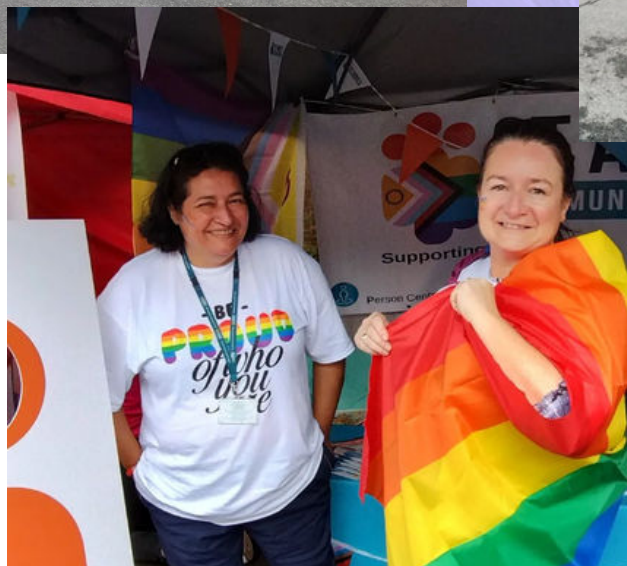
Our team at Hull Pride